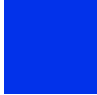
Blue - BLU