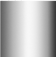
Brushed Gold - BGD