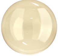
Amber - AMB