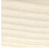
Ash White Oil Waxed - ASH