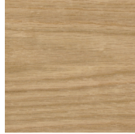
Oak Natural - OAK