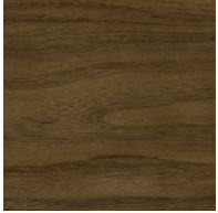
Walnut Natural - WAL