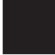
Black - BLK