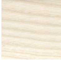
Ash White Oil Waxed - ASH