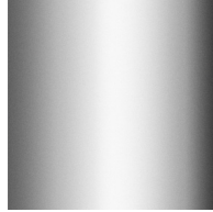
Chrome - CHR