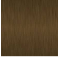
Brushed Bronze - BBZ