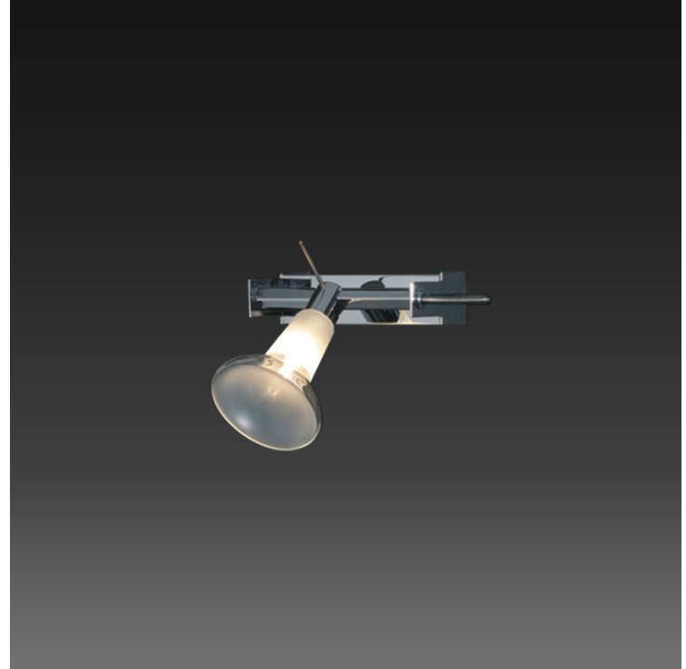
D1-5008 WITH D9-9000 DIFFUSER

Certified By: CSA Certified to UL and CSA Standards IP rating: IP20