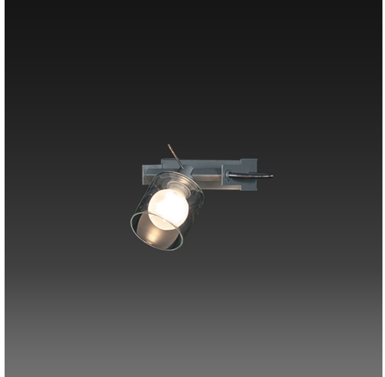
D1-5008 WITH D9-9000 DIFFUSER

Certified By: CSA Certified to UL and CSA Standards IP rating: IP20