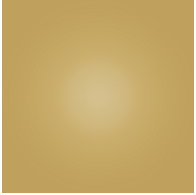
Amber - AMB

Digital: Not all screens are calibrated the same, and therefore, colors will appear differently between screens.