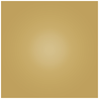
Amber - AMB

Digital: Not all screens are calibrated the same, and therefore, colors will appear differently between screens.