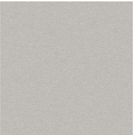
Titanium - TIM

Digital: Not all screens are calibrated the same, and therefore, colors will appear differently between screens. Physical: When texture is involved, there will be variations in color, character and tone within a product series and between product families.