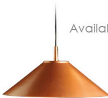
Copper Lacquer & Copper Lacquer