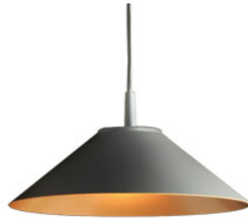
Gray Lacquer & Gold Lacquer