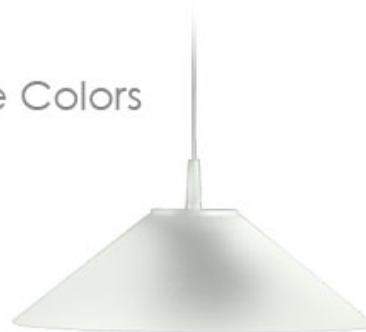
White Textured Lacquer & White Textured Lacquer