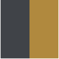
Anthracite Gray Lacquer/Gold - AGG

Digital: Not all screens are calibrated the same, and therefore, colors will appear differently between screens.